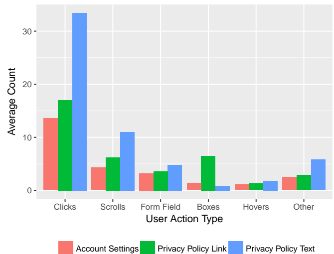
Figure 4. Number of clicks, scrolls, form fields, check boxes, hovers, and other user actions, averaged over all websites, in the participants’ interaction with account settings and policy choices.

Figure 4 displays the number of user actions in participants’ interaction path when using privacy choices located in the account settings and privacy policy. Using a choice mechanism in account settings resulted in an average of 26.1 user actions (min: 8, max: 43, sd: 11.5). Interactions using links in the privacy policy had 37.5 actions (min: 11, max: 59, sd: 15.2), on average, and those with text instructions in the policy had 57.6 (min: 18, max: 87, sd: 27.5). While policy links took participants exactly where they needed to go, text instructions were vague and required extra effort to figure out what to do. Furthermore, participants took many more steps than text. However, it is still unclear which privacy rights listed can be accomplished by the two mechanisms shown.