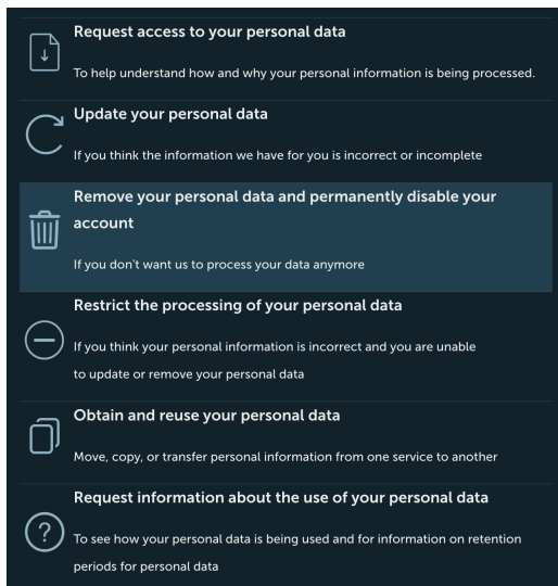
Figure 3. List of data rights available on runescape.com which misleadingly seem clickable.

Conversely, colorado.edu’s privacy policy contained links to the three advertising opt-out tools in a single paragraph, which led participants to at least see all three tools (even if none actually selected all three, as discussed in the next subsection).